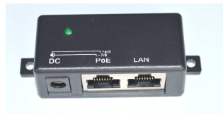
1 port and 8 port devices and power supplies